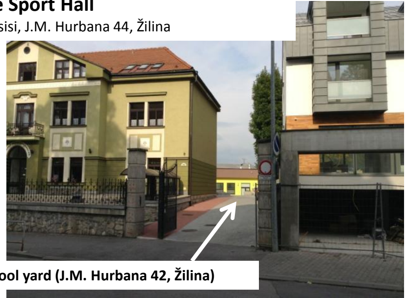
Entrance to the Sport Hall through the school yard (J.M. Hurbana 42, Žilina)