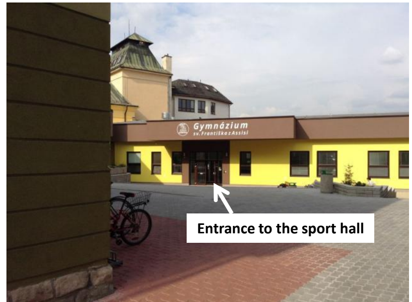
Entrance to the sport hall